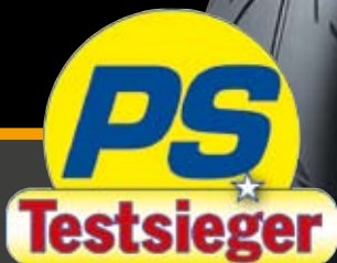
ContiSportAttack Test winner in the German magazine PS (May 2008)

In addition, the use of aromatic-free oils, which was also introduced in 2007 under the aspect of sustainability and environmental protection, also enhances the efficiency of the latest ContiSportAttack. An achievement that keeps the ContiSportAttack at the top of the current super-sport tyre range.